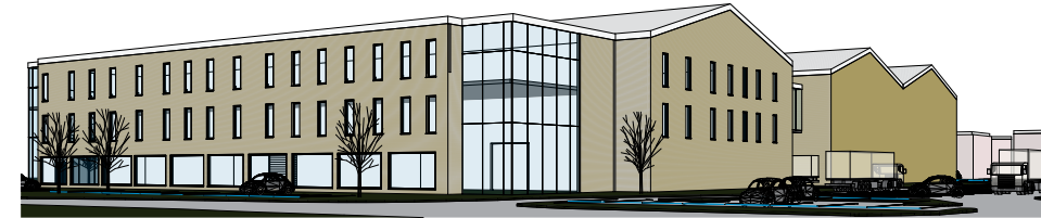
① 3D Perspective View 1