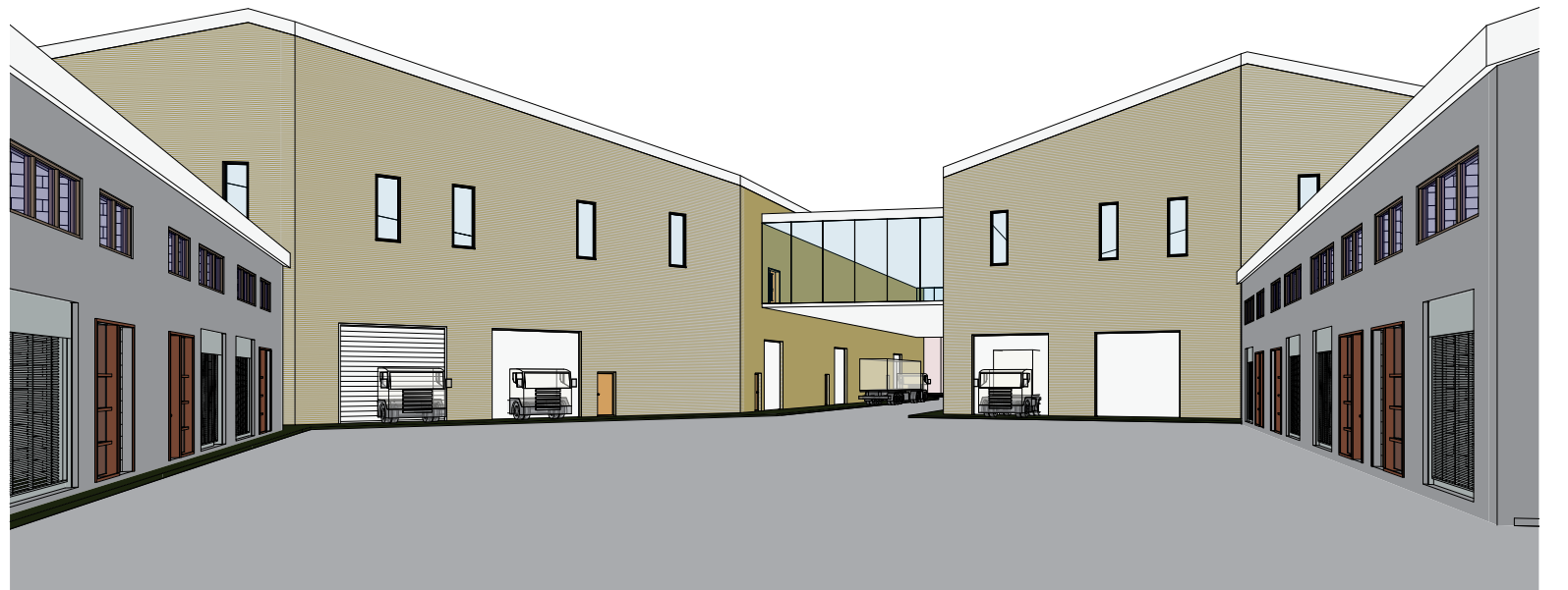
② 3D Perspective View 4