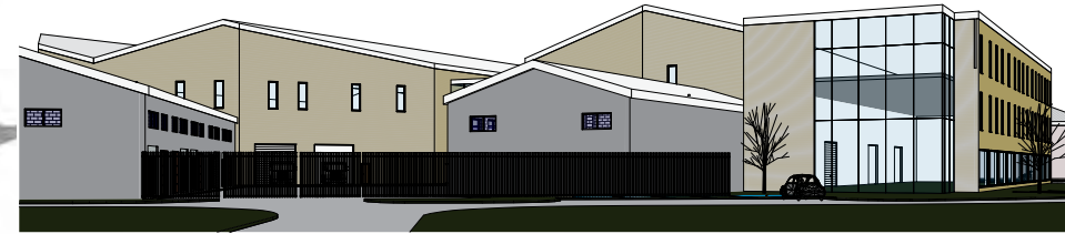
② 3D Perspective View 2